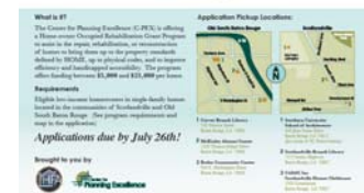
C-PEX Home Rehabilitation Poster.