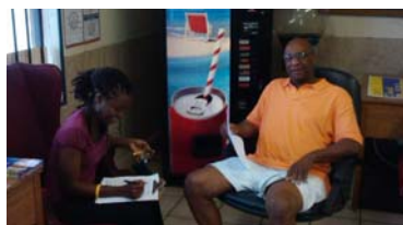
Students carrying out surveys with business owners for inclusion in the SCCDP and FUTUREBR.