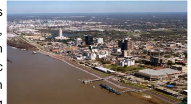
Baton Rouge, Louisiana

The Urban + Rural Community Design Research Center (U+R CDRC) is located at Southern University's School of Architecture in Baton Rouge, Louisiana. The U+R CDRC is an outreach activity of the Southern University School of Architecture. The U+R CDRC provides specific technical assistance in architectural design, planning and construction management in the project area. Activities include using the planning process as a tool to build strong community support and pride, providing the project area with a community sanctioned comprehensive master plan for physical and economic development, providing tangible results that enhance the development of the project area.