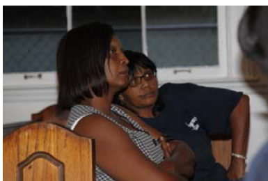
Concerned Scotlandville residents who attended the Listening tour on Oct. 6th 2009 at Community Bible Baptist Church.

Local community and faith-based organizations are working with the Southern University Center for Social Research and Southern University Urban + Rural Community Design Research Center at the School of Architecture to develop a Vision for Scotlandville. This Joint Resident-Community Organization and University effort is to provide an opportunity for Scotlandville