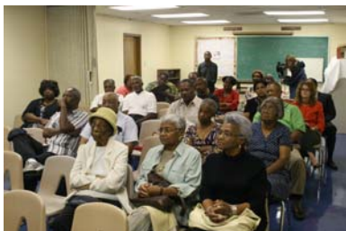
Residents listening to a question from a fellow community member at Greater Mount Carmel Baptist Church on October 13, 2009.